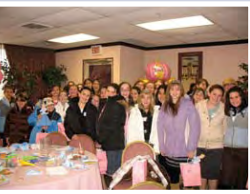
Middle school girls enjoy a lunch buffet and cookie decorating at Kirshner's Cuisine during "Princess for a Day with ICJA."