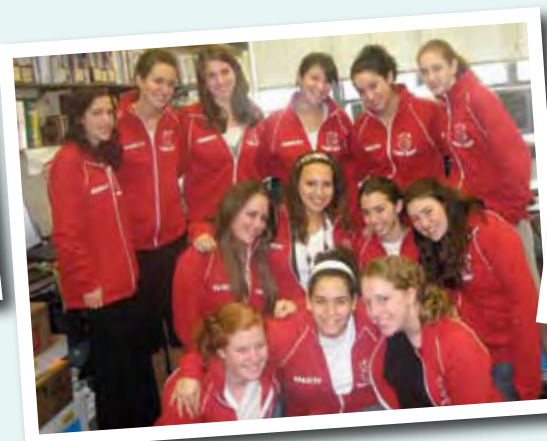
The Varsity Girls' Basketball team.