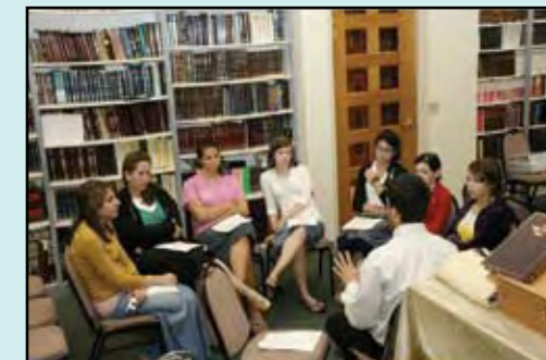
ICJA girls learn at Or Torah for Torah Leadership Network.