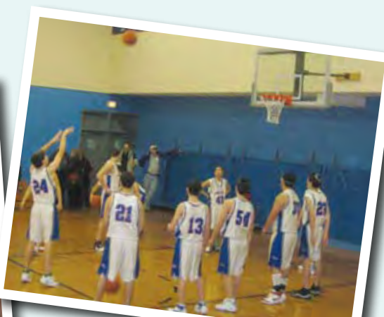
The Varsity Boys' Basketball team.