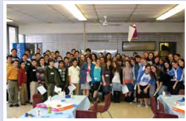
Hillel Torah Students join ICJA senior leaders for a snack before heading to classes at the Academy for the morning.