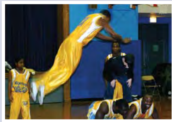
An Akiba Schechter student joins the Chicago Boyz Acrobatic Team performing for middle school boys in the ICJA gym.