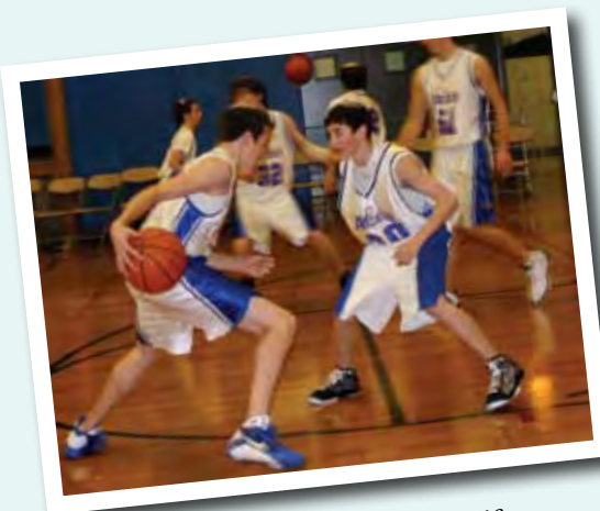
JV boys warm up for a game