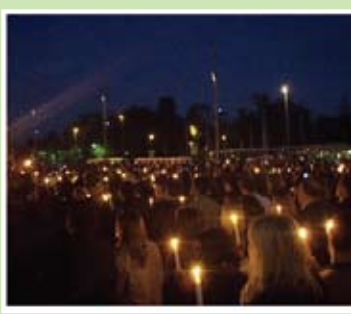
A candlelight vigil on Yom HaShoah in Geneva.