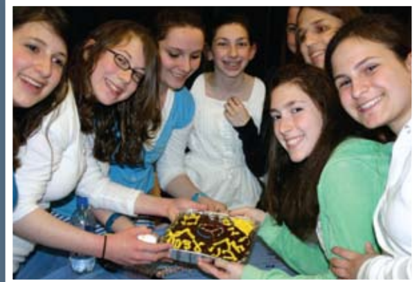
Academy students show off the cake they decorated for the cake competition on Yom HaAtzmaut. The winning team got to choose where in Israel to send tzedakah funds that had been raised that day.