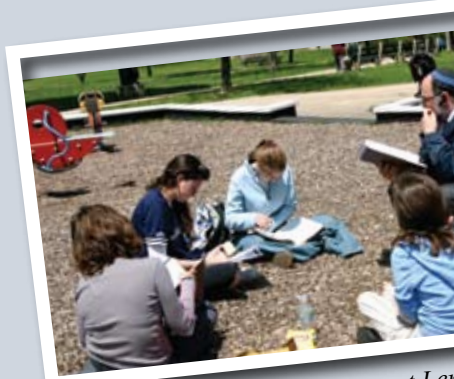
The girls' Talmud course meets at Lerner Park during the ICJA Lag BaOmer picnic.