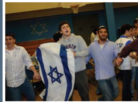
Academy boys dance in the gym on Yom HaAtzmaut.