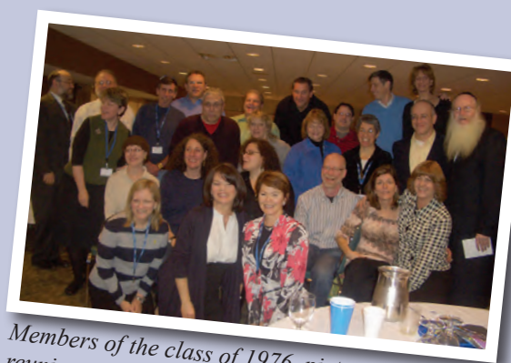
Members of the class of 1976, pictured at their reunion in November.

For information on organizing a class reunion, contact the ICJA office at 773.973.1450. To join the 2010 Alumni Association, go to icja.org