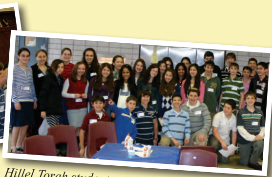
Hillel Torah students visiting ICJA.