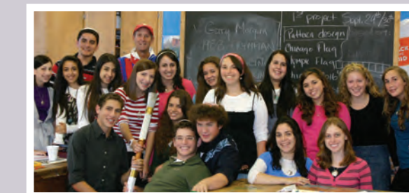
Art students pictured with Olympic race walker.

Nearly 100 students in grades 10-12 joined Chicago's Olympic enthusiasm by researching and recreating Olympic designs in art class. Students researched the colors, shapes and symbolism in the Olympic logo, the 2016 logo and the Chicago flag. They then took the basic shapes and colors and overlapped them to create distinct patterns. The 10th grade students used markers only and the advanced art students used paints.