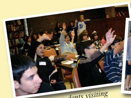
Arie Crown students visiting the Beit Midrash at ICJA.

The visits were in addition to the successful annual open house in the fall, attended by close to 200 people. Many of these students will also join Aces Sports Clinics in the Spring. We look forward to welcoming many of these students and their families to the ICJA class of 2014!