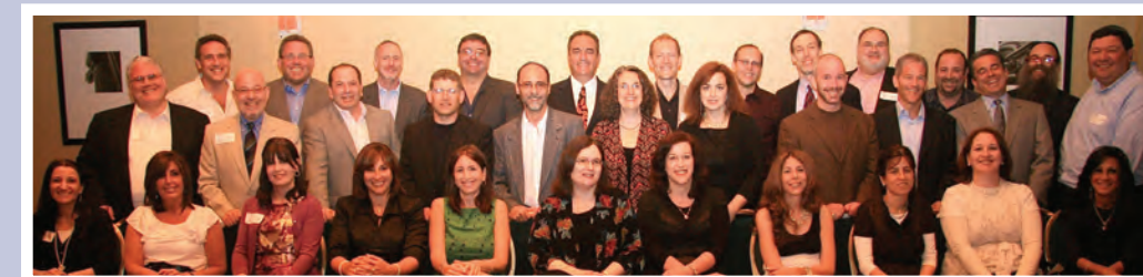
Members of the class of 1979, pictured at their reunion last July.

"I ENJOY TEACHING AND WANT TO CONTINUOUSLY IMPROVE MY PRACTICE."